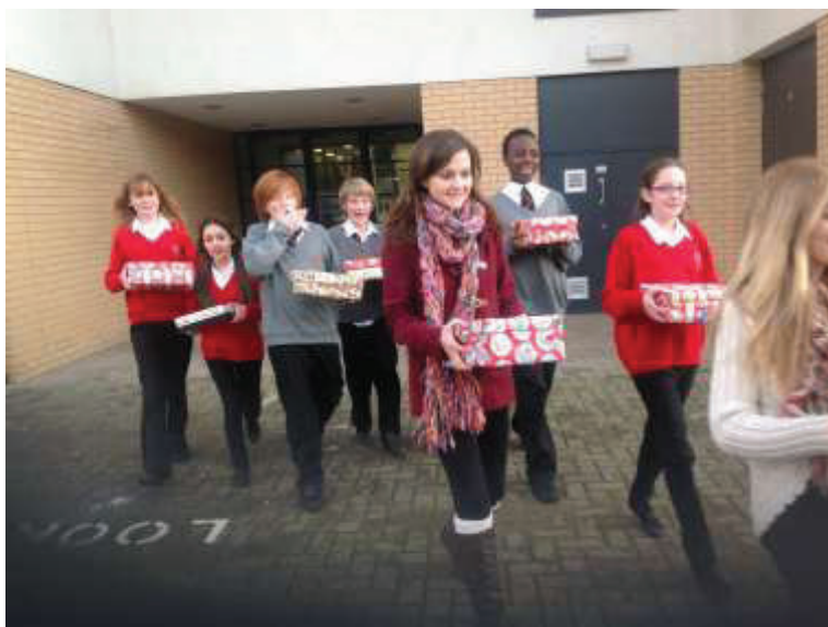
Students from St Joseph's Roman Catholic College respond to a campaign for Shoeboxes for Women's Refuge Centres

2011 - 2012 has seen a year where Swindon SACREs commitment to RE has been actively demonstrated through its tireless letter writing campaign to MPs and other prominent leaders. Members of this SACRE attend well and work hard to act as guardians and propagators of exciting RE and reflective Collective Worship in Swindon Schools.