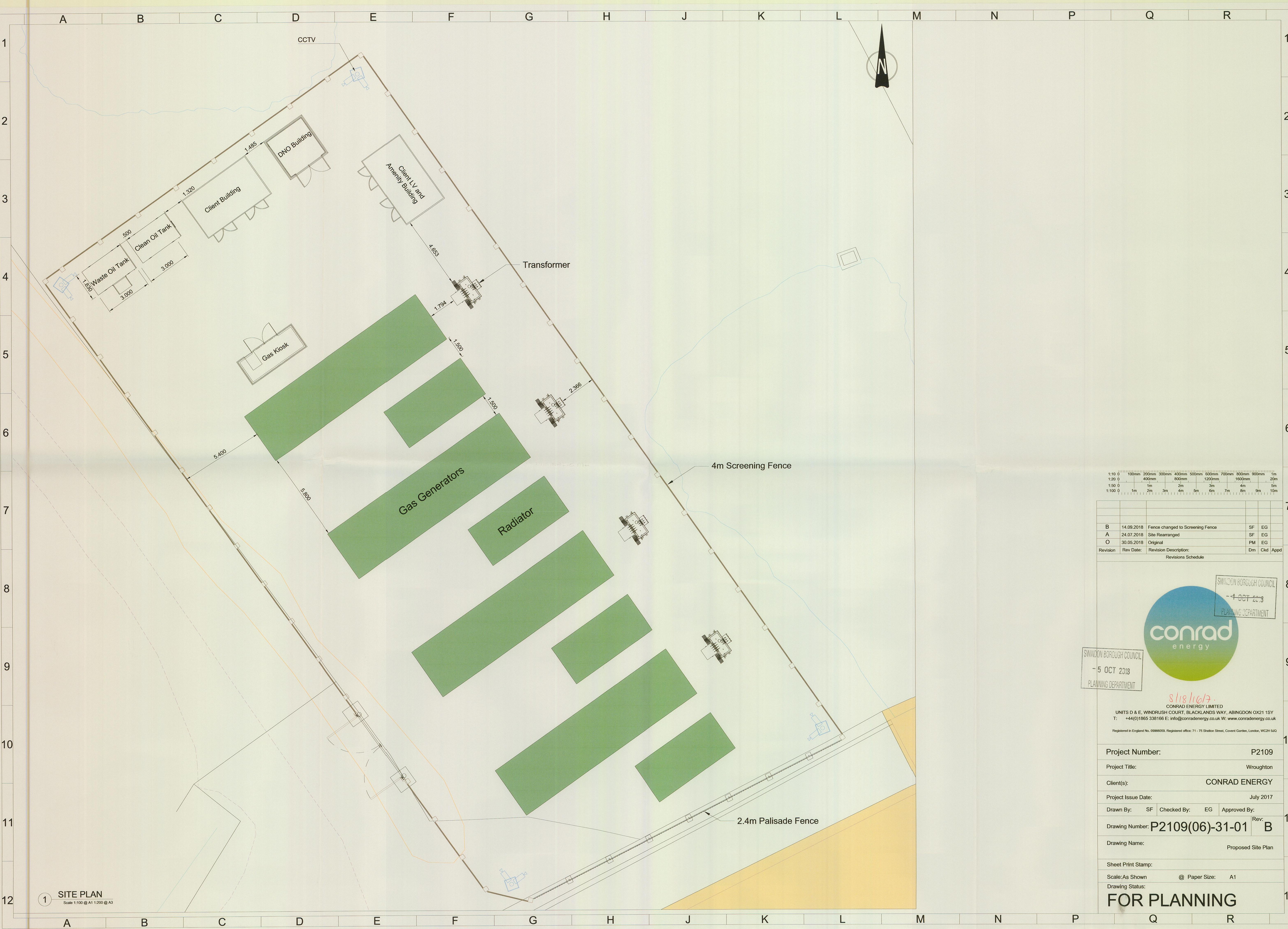
1 SITE PLAN Scale 1:100 @ A1 1:200 @ A3