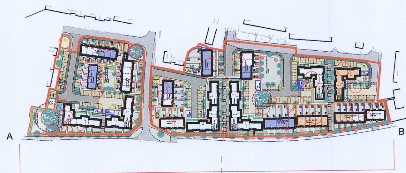
Key Site Plan