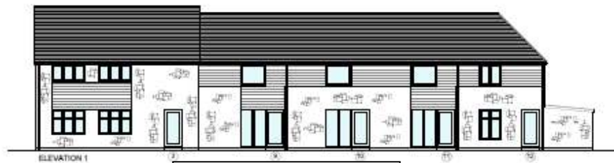
Facing Cricklade Street