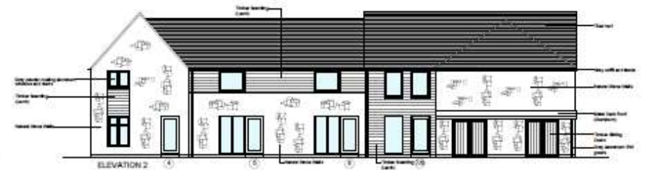
Facing Church Road