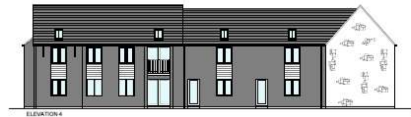
Facing Cricklade Court