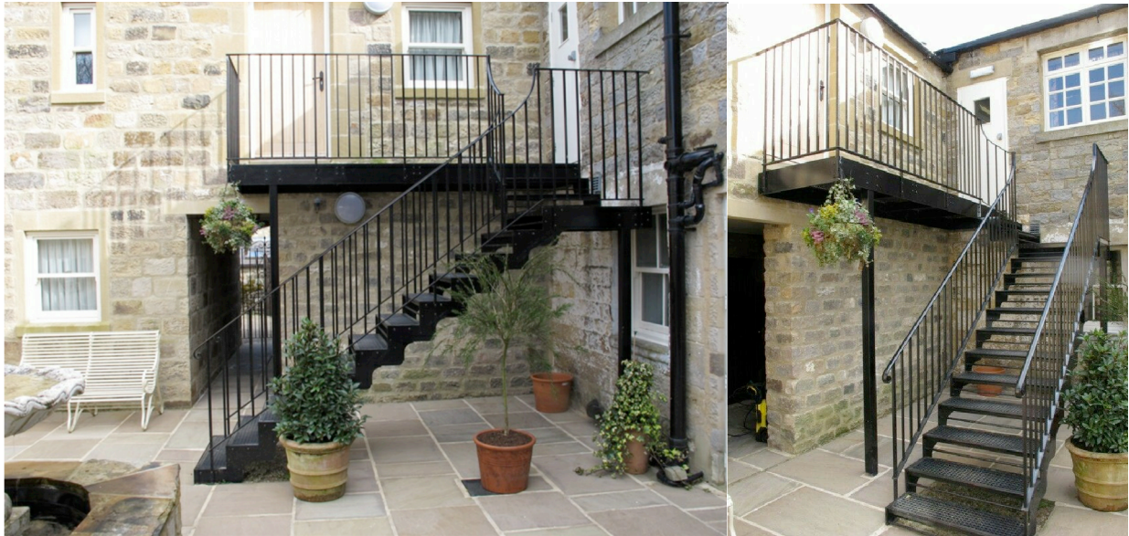
EXAMPLE EXTERNAL STAIRCASE DETAILING & BALUSTRADE