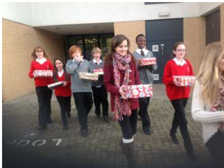
Students from St Joseph's Roman Catholic College respond to a campaign for Shoeboxes for Women's Refuge Centres

2011 - 2012 has seen a year where Swindon SACREs commitment to RE has been actively demonstrated through its tireless letter writing campaign to MPs and other prominent leaders. Members of this SACRE attend well and work hard to act as guardians and propagators of exciting RE and reflective Collective Worship in Swindon Schools.