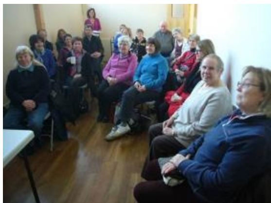
Sports Bid 2017

Engagement and involvement work sometimes meant working in partnership with other organisations – as in this with Swindon Borough Council prior to an application by them to Sport England for some targeted funding.