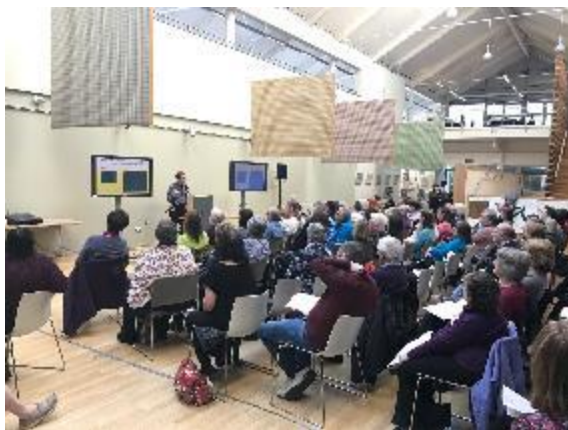
Community Conference January 2017

In January 2017 Swindon's community and voluntary sector came together for a Community Conference at the National Trust 'Heelis' head offices, organised by Voluntary Action Swindon.