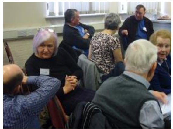
PHWE event November 16

In November 2016 we co-hosted a workshop “using and understanding research evidence” with them at our Sanford House base.