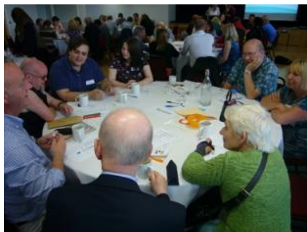
Mental Health Event July 2016

We were pleased to be involved in an engagement event with Avon and Wiltshire Mental Health Partnership Trust in July 2016.