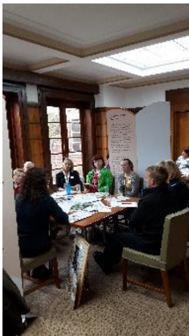
Break out session - Ageing Well

Delegates heard from speakers on Dementia Services, Dementia Design, Sanford House, Swindon Hindu Temple, Swindon Travel Choices, Live Well Swindon, Libraries and Information Services, Safe Places scheme and Volunteering.