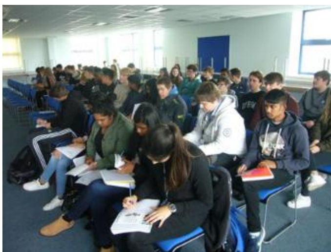
New College students 2017

We asked 100 students about their knowledge of access to urgent care services and published our findings. Our objective was to test out students' awareness of the local alternatives to a GP appointment should a friend become unwell or injure themselves.