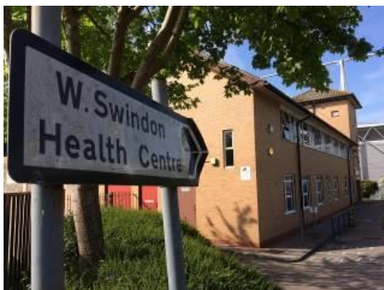
West Swindon Health Centre