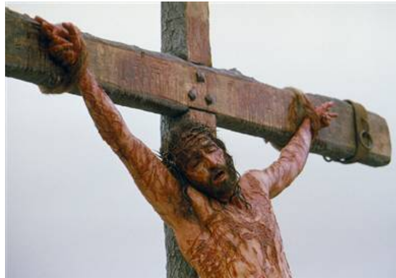
Still from the Film The Passion of Christ

Only one conclusion is possible: On that first Easter, Jesus Christ rose from the dead by the power of God. And because He did, you and I have hope of eternal life. Death and Hell and Satan have been defeated!.'