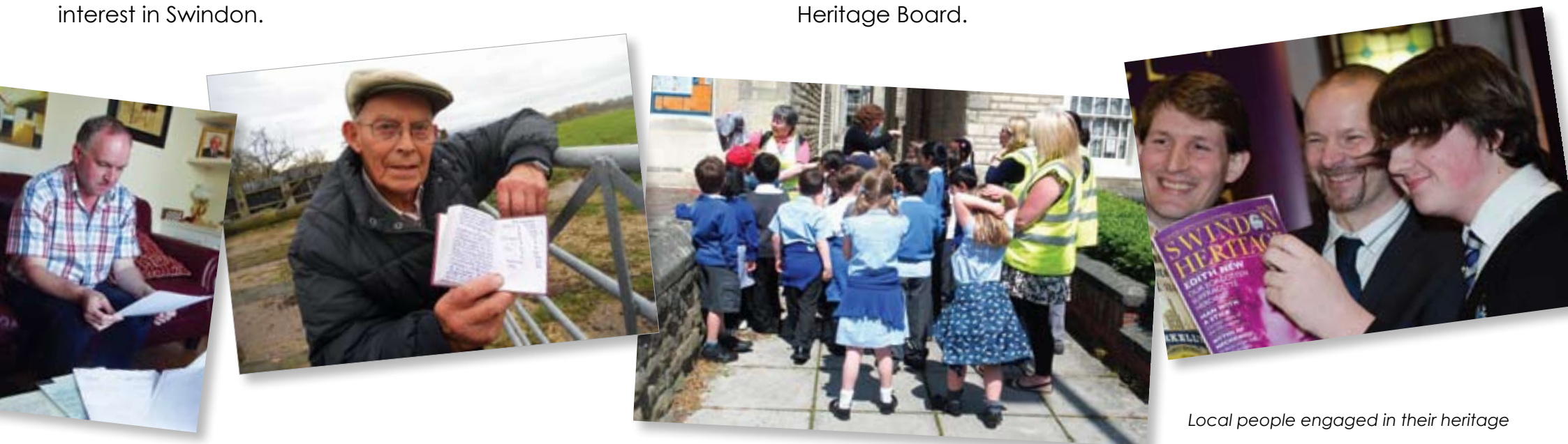
Local people engaged in their heritage

The Swindon Heritage Board is responsible for the development of and accountable for the Swindon Heritage Strategy, and will take responsibility for its coordination and development through the agenda of actions and timetable. It will however be essential that the Strategy is adopted by Swindon Borough Council following endorsement by the Board. Heritage initiatives identified in the Action Plan will be delivered on a project by project basis by all relevant stakeholders working together through the Swindon Heritage Board.