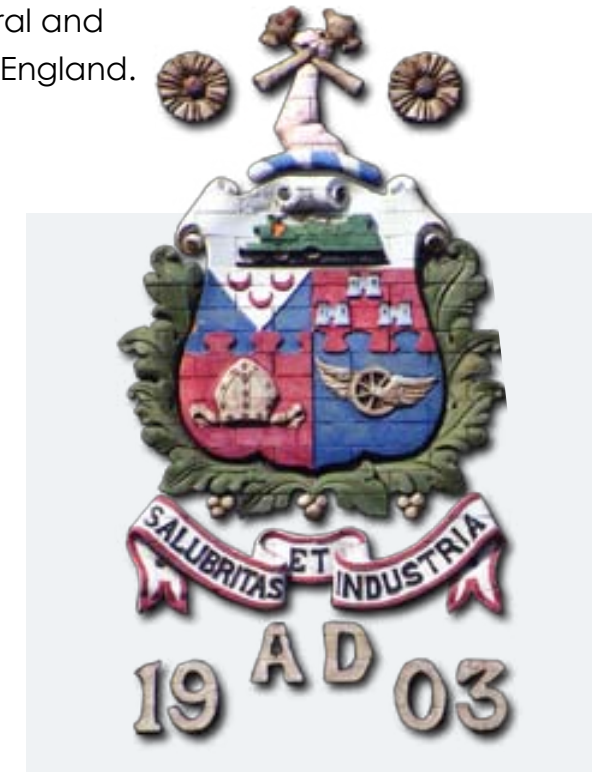
Far left: The Evening Star Left: Outside the GWR Railway Works Above: Swindon Coat of Arms