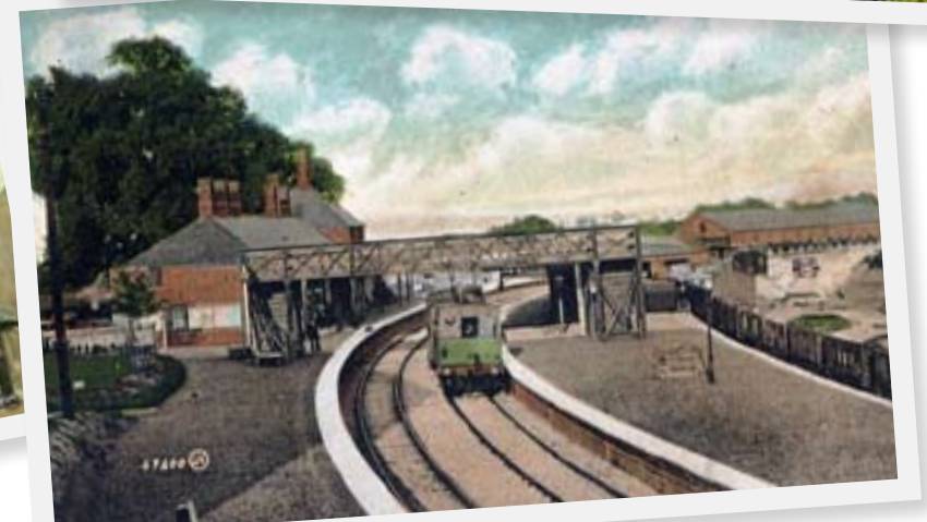
Right: Mechanics' Institute Far right, top to bottom: Technical Schools; GWR Park; Old Town station.