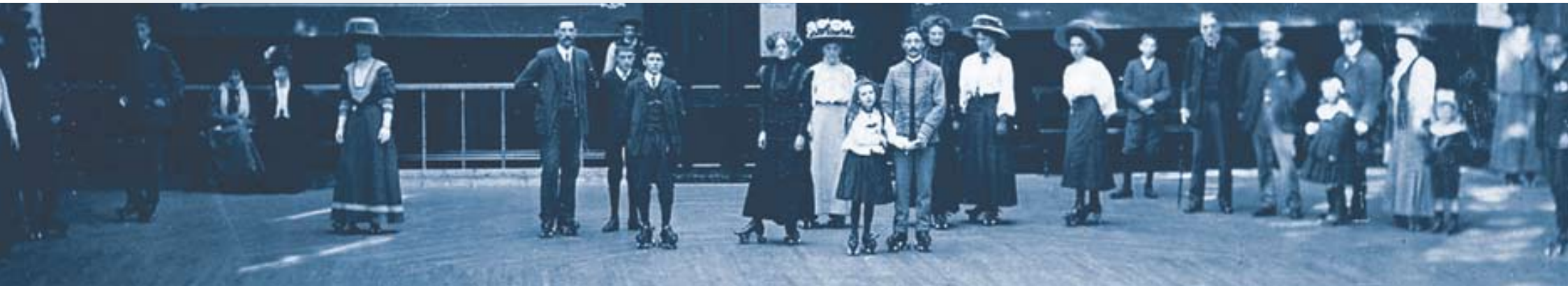
Swindon skating rink