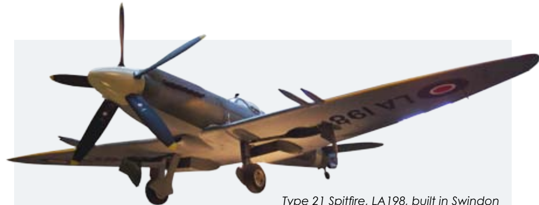
Type 21 Spitfire, LA198, built in Swindon

Today, Swindon still attracts state-of-the-art engineering, with the modern car industries of Honda and BMW, plus a multitude of other industries and their award-winning sites, such as the Cellular Operations building, known locally as the “Glass Banana”, and the Renault distribution centre ( left ), used in a James Bond movie and now given Grade II* listed status by English Heritage.