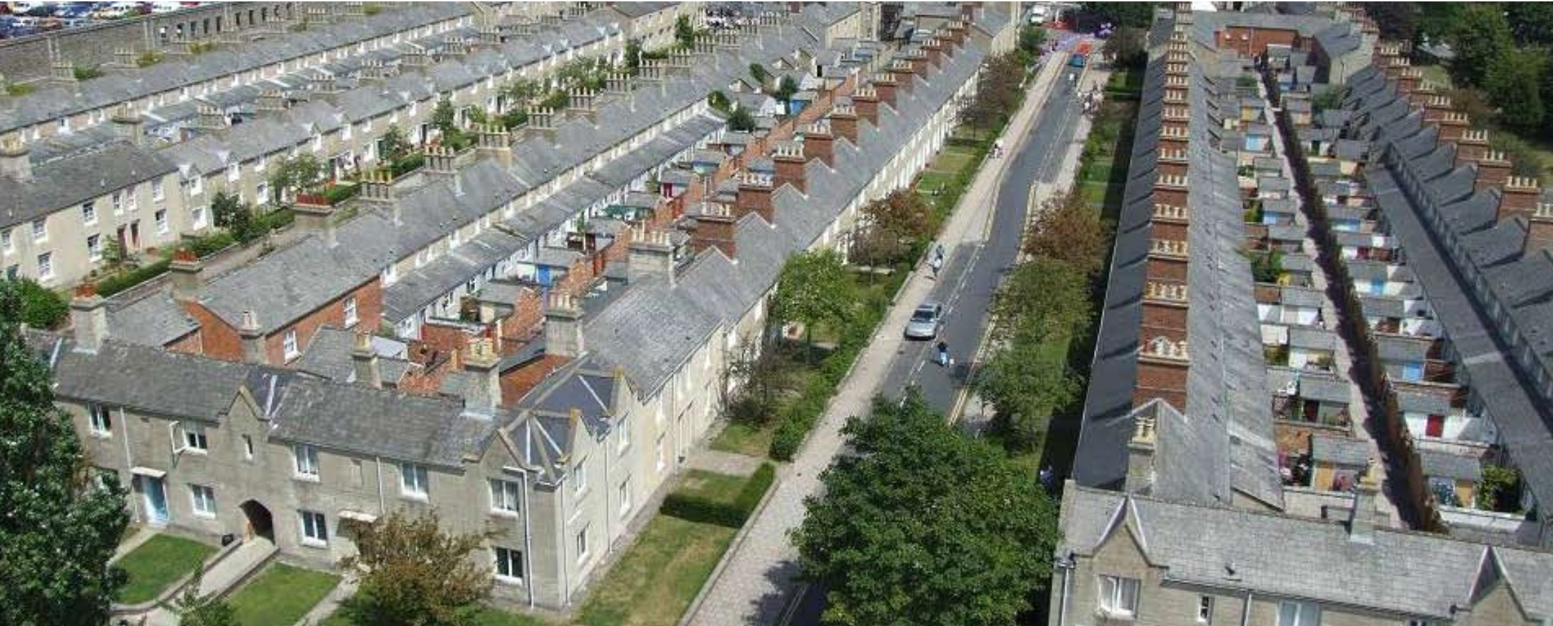
The GWR Railway Village

A summary of the designated assets for Swindon is included at Appendix III.