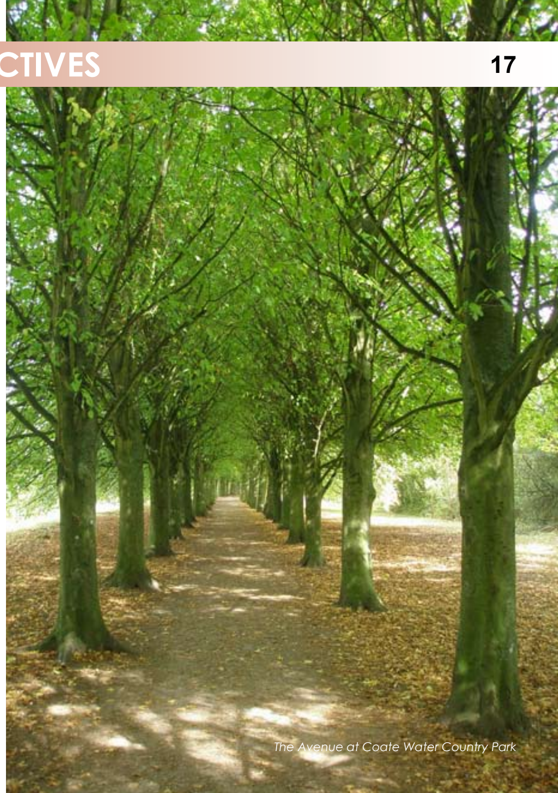
The Avenue at Coate Water Country Park

This work identifies and recognises that there are tensions between stakeholders, given the scale of heritage requiring support and investment across the Borough, and a key to success for the delivery of the objectives within the Strategy will be how stakeholders can work together to define and support a programme of activity around our collective assets.