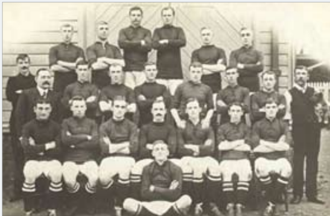
Swindon Town FC 1910 and, opposite, the Children's Festival in the GWR Park

Swindon's culture is likewise growing and needs to be celebrated and developed. It is the intention of this strategy to promote opportunities for this through activities such as literary, art and music festivals, the rediscovery of historic events such as the GWR Children's Fete, Heritage Open Days, the national Festival of Archaeology, and through sporting activities. After all, Swindon Town Football Club has its own important history since it became professional in 1894.