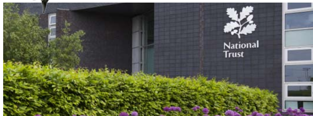
Left to right: Science Museum (and, above, one of the many artefacts stored there); English Heritage; National Trust.