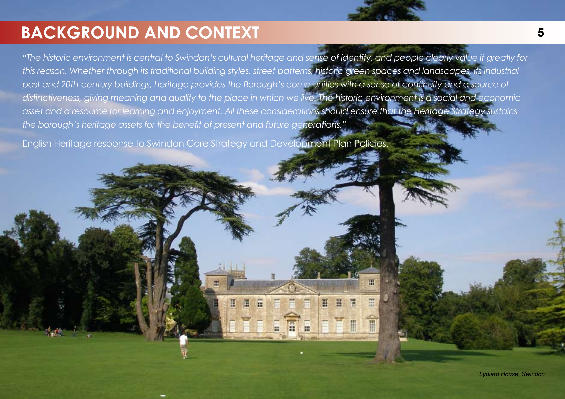
Lydiard House, Swindon

English Heritage response to Swindon Core Strategy and Development Plan Policies.