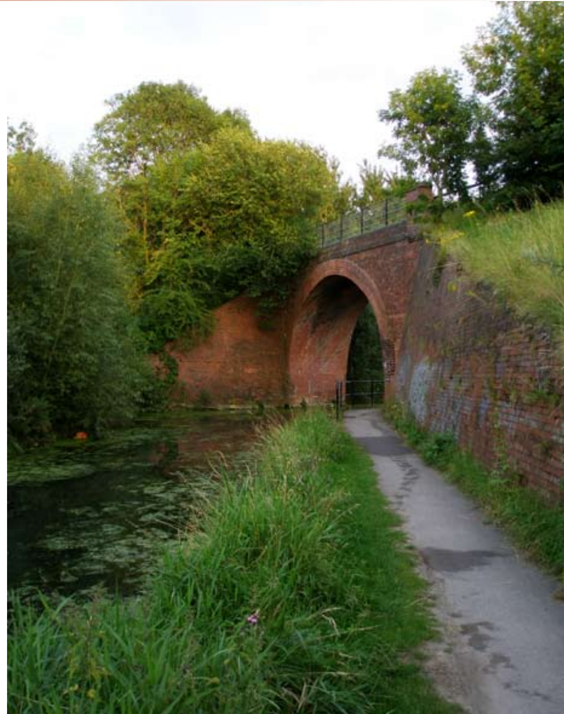
Bridge over the Wilts & Berks Canal in Swindon