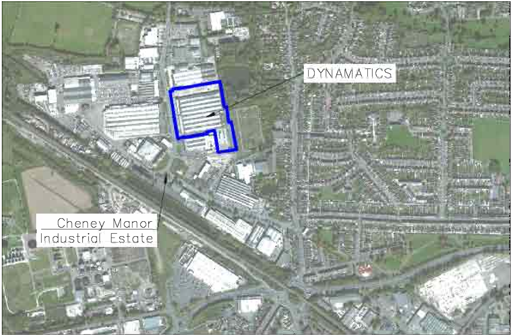
Scale 1:8000 @ A1