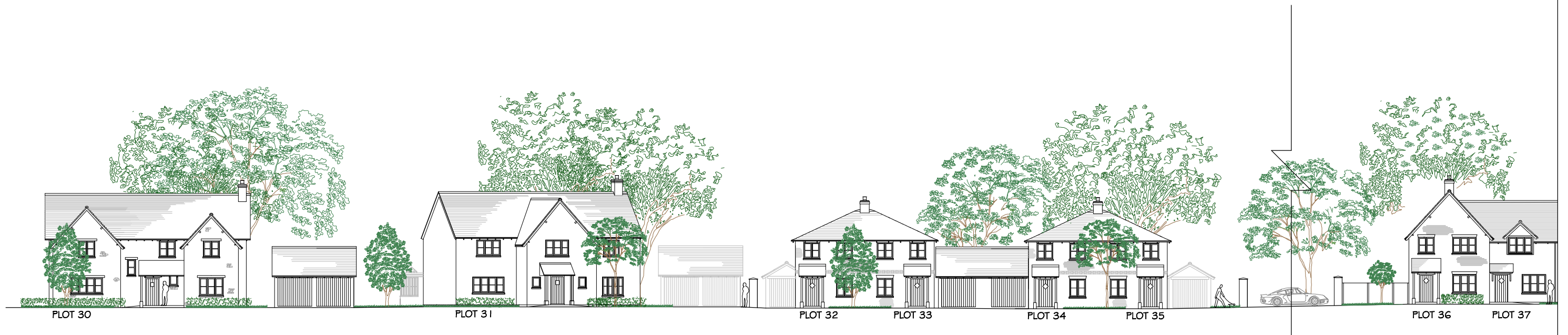
SECTION A - A