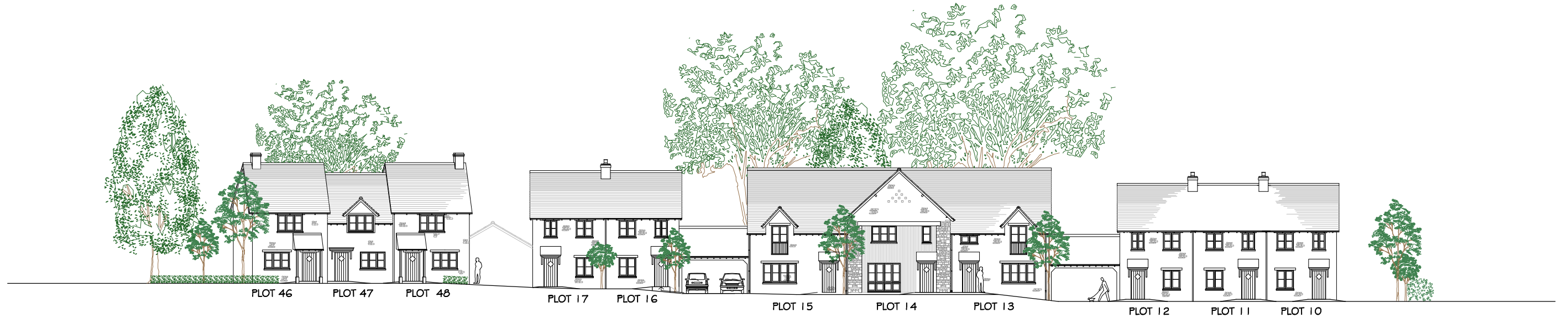
SECTION B - B