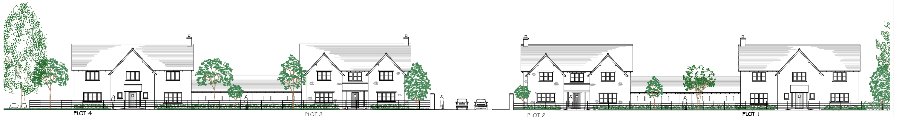
SECTION C - C